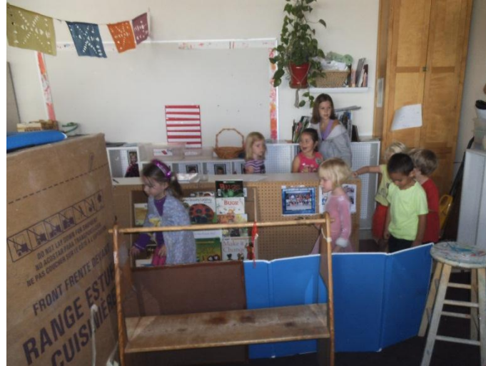
The children enter the maze to experience vocabulary concepts such as "in," "under," and "through."