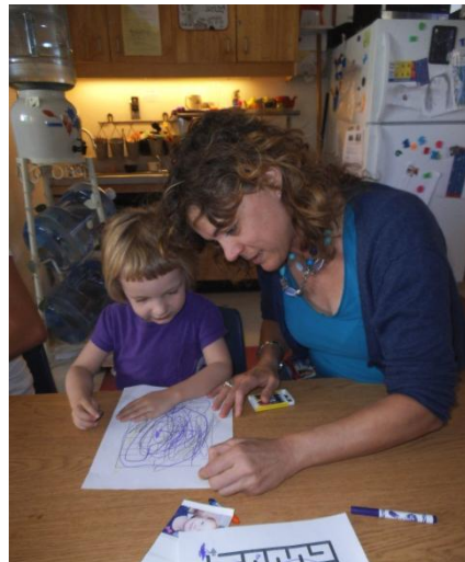
We use short markers and crayons to encourage children to use a tripod grasp. Writing with a fist grip is tiring and not as controlled.