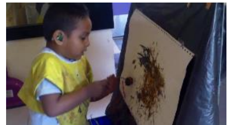
Painting with leaves