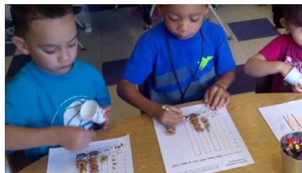
Tasting and Graphing