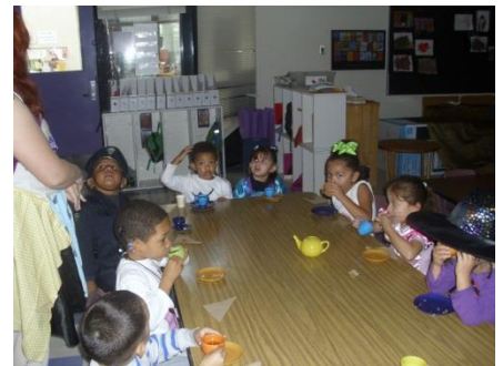
Making pumpkin bread and having a tea party.