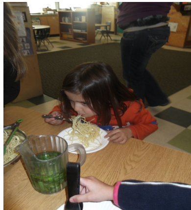
♪ Tuesday, Spaghetti ♪