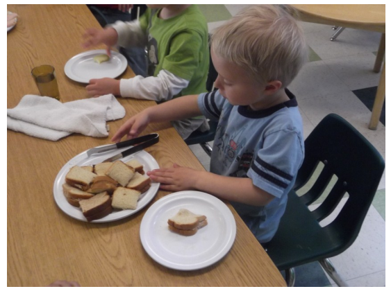
♪ Thursday, Roast Beef ♪