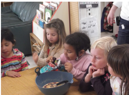
♪ Wednesday Zooop! ♪