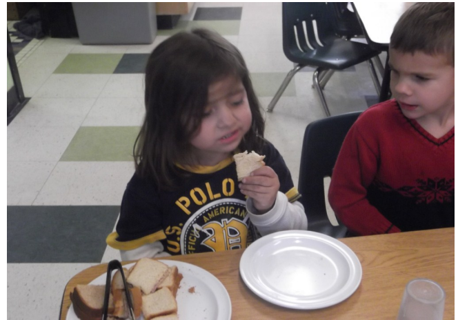
♪ Friday, Fresh Fish ♪