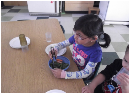
♪ Monday, Green Beans ♪

This week the afternoon class read "Today is Monday" illustrated by Eric Carle. The book outlines a weekly menu that is read in a sing-song repetition, making it easy for children to memorize and repeat. While learning the days of the week, students helped make and eat the foods in the story to provide experiential opportunities for children. Tasting foods from the story allows children to develop a connection to the material and shared prior knowledge. 1-13