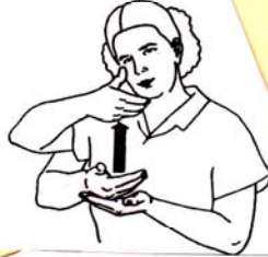
[Action of scooping cereal from bowl to mouth]