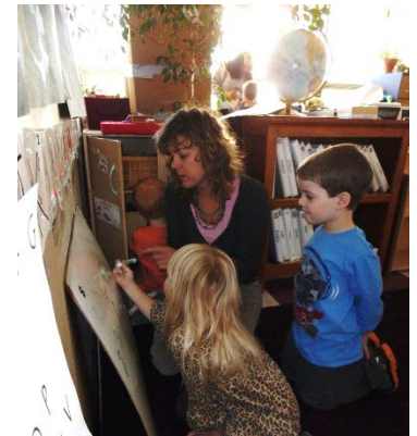
Children take turns pointing to the top, middle, and bottom of letters while listening to the song: "Where do you start your letters? (At the top)." These skills will help them when they write.