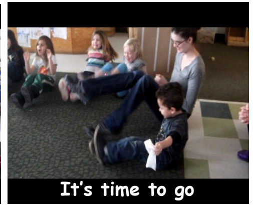
It's time to go