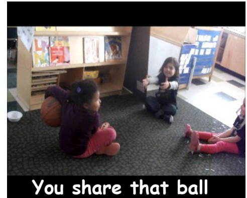
You share that ball