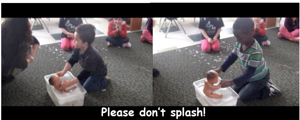
Please don't splash!