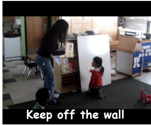
Keep off the wall