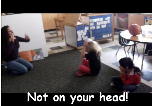
Not on your head!

The class read Please, Baby, Please by Spike Lee and Tonya Lewis Lee. The book features repetitive phrases and sing song rhythm that makes memorization easy for students. As a circle time activity, students acted out the book by participating in the bad behavior that Baby in the book did. The book also featured clocks with the time that Baby's bad behavior occurred at, this offers practice for students to expand their knowledge about time. 1-13